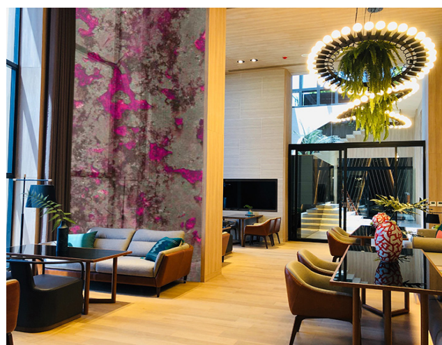
Add interest, energy and light with a feature wall.

With a wide range of decorative glass collections, you'll be sure to find the perfect pattern, style, and decorative glass product for your design. Each of our collections are completely customizable and offer you the ability to adjust patterns, colors, gradients, and opacities to achieve your design vision. You can even supply your own custom designs to apply directly to glass using any decorative glass technique.